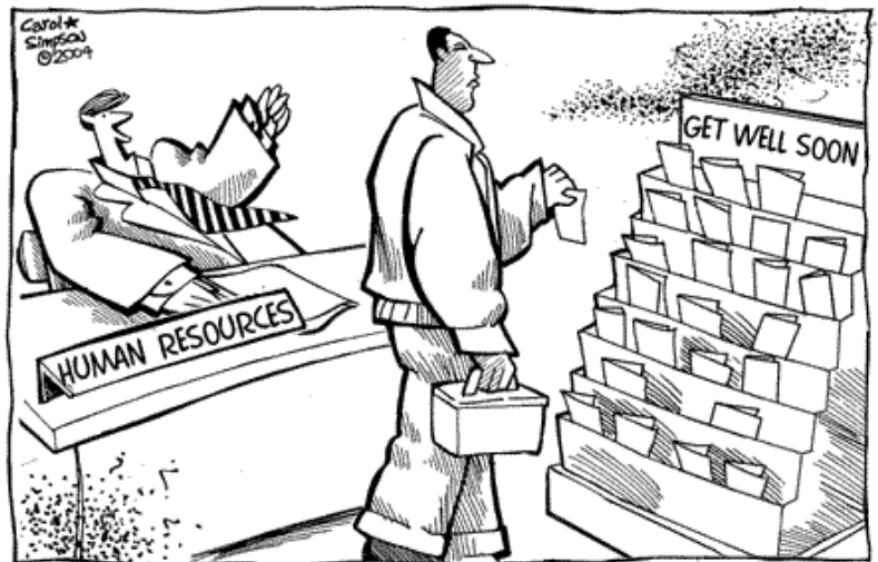
"It's our revised retiree medical plan. A selection of tasteful cards."

But Maggie believed the old have a special advantage in the fight "Nobody can tell us to shut up," she said. "We can be as radical as we want...And there is room for anger. But you must channel your rage. My goal — until the rigor mortis sets in — is to do one outrageous thing every week. Like putting sequins around my age spots."