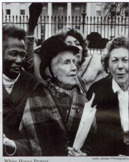
White House Protest

All members are welcome to steering committee meetings held monthly the 4th Tuesday at 1 PM in the Cypress Room at Hart Center.